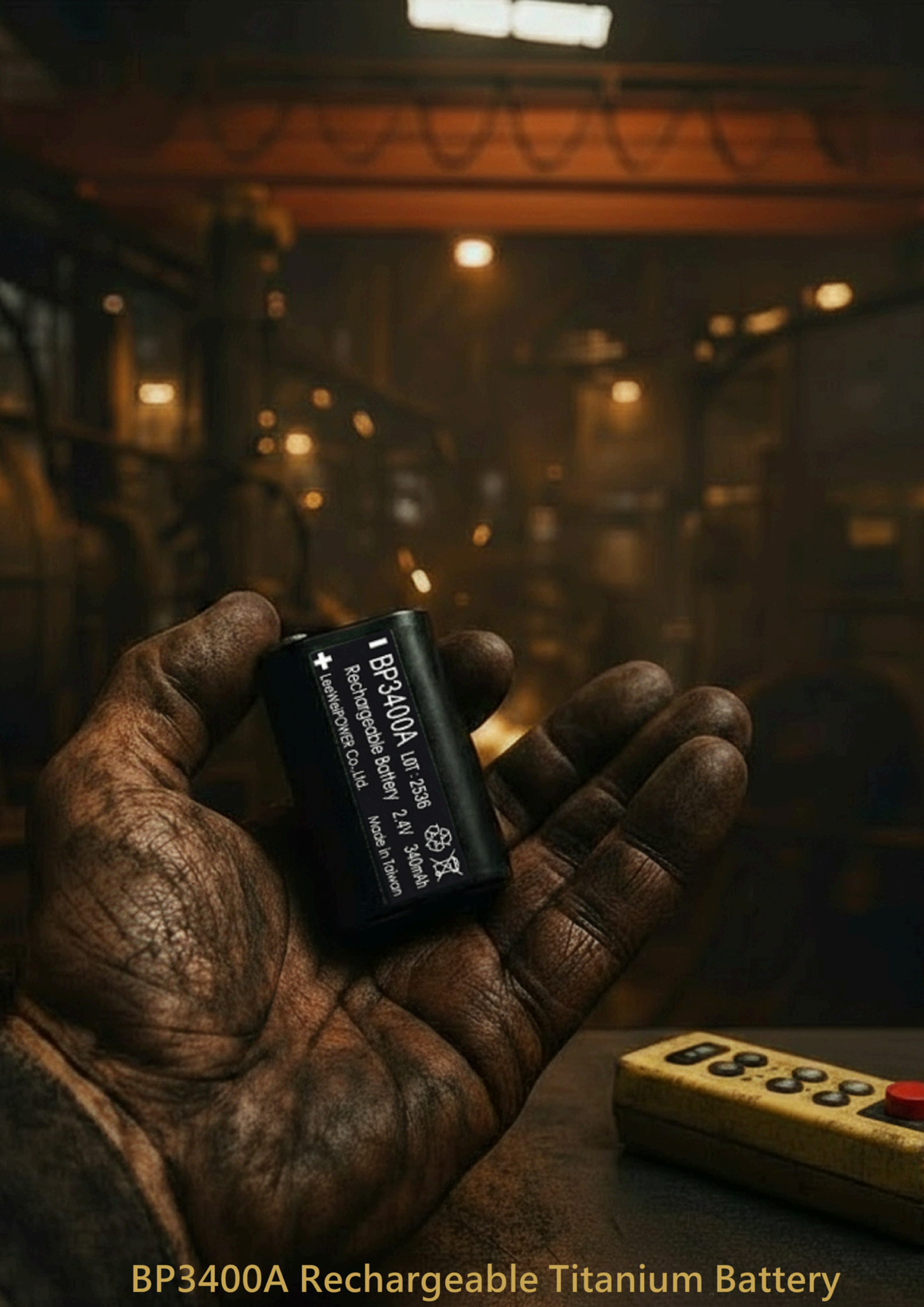
BP3400A Rechargeable Titanium Battery